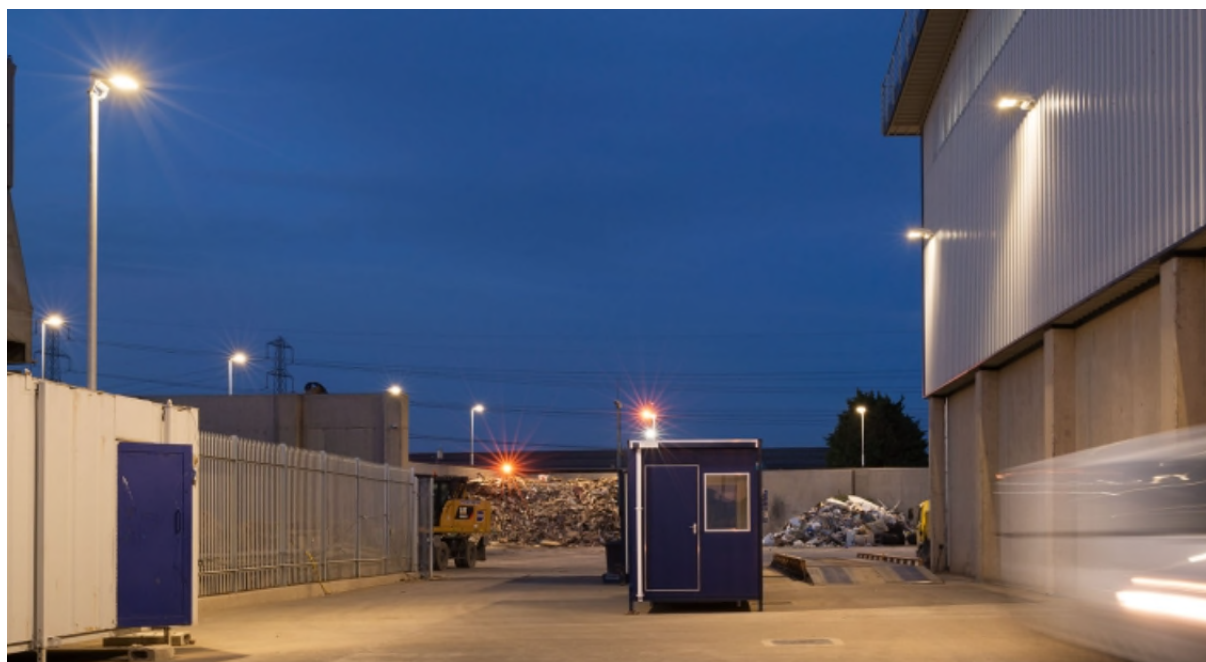
Figure 4.1: Example lighting in an industrial area

4.2.5 This approach is standard practice on modern street lights where poor low/high pressure sodium lights (with no control) have been replaced by light emitting diode (LED) lights; in some cases the light beams can be modified to only illuminate certain areas. Wherever possible, lighting installation components (lamps, control gear, luminaires, control systems etc.) shall satisfy the criteria detailed within the Energy Technology Criteria List set by the Carbon Trust in the Energy Technology Criteria List, Revision 1 (June 2021) published by the Department for Business, Energy & Industrial Strategy.